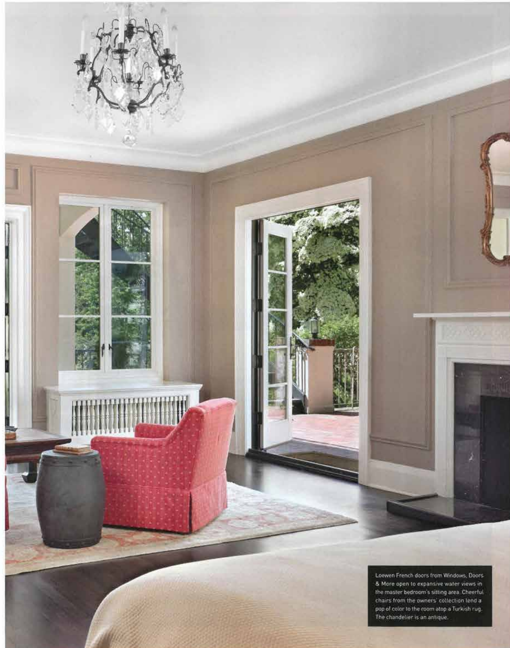
Loewen French doors from Windows, Doors & More open to expansive water views in the master bedroom's sitting area. Cheerful chairs from the owners' collection lend a pop of color to the room atop a Turkish rug. The chandelier is an antique.