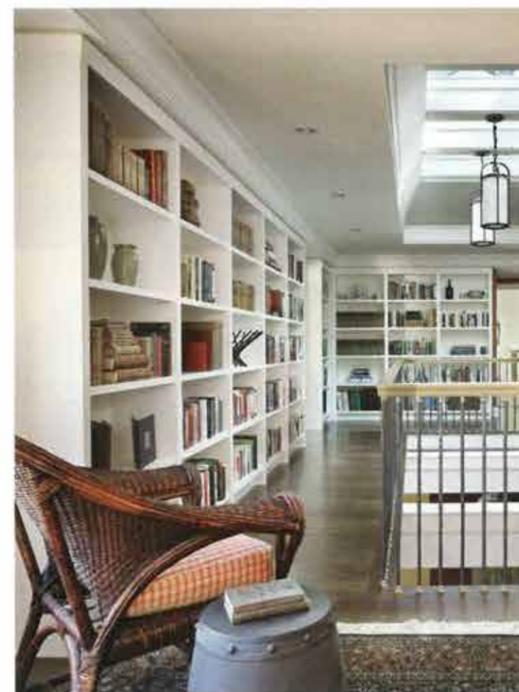
Above: Feiss pendants hang above the double-height library, and French doors by Loewen open onto a courtyard. The balustrade, fabricated by Metal Solutions, matches the existing railings. Left: A McGuire chair offers a cozy spot for reading.