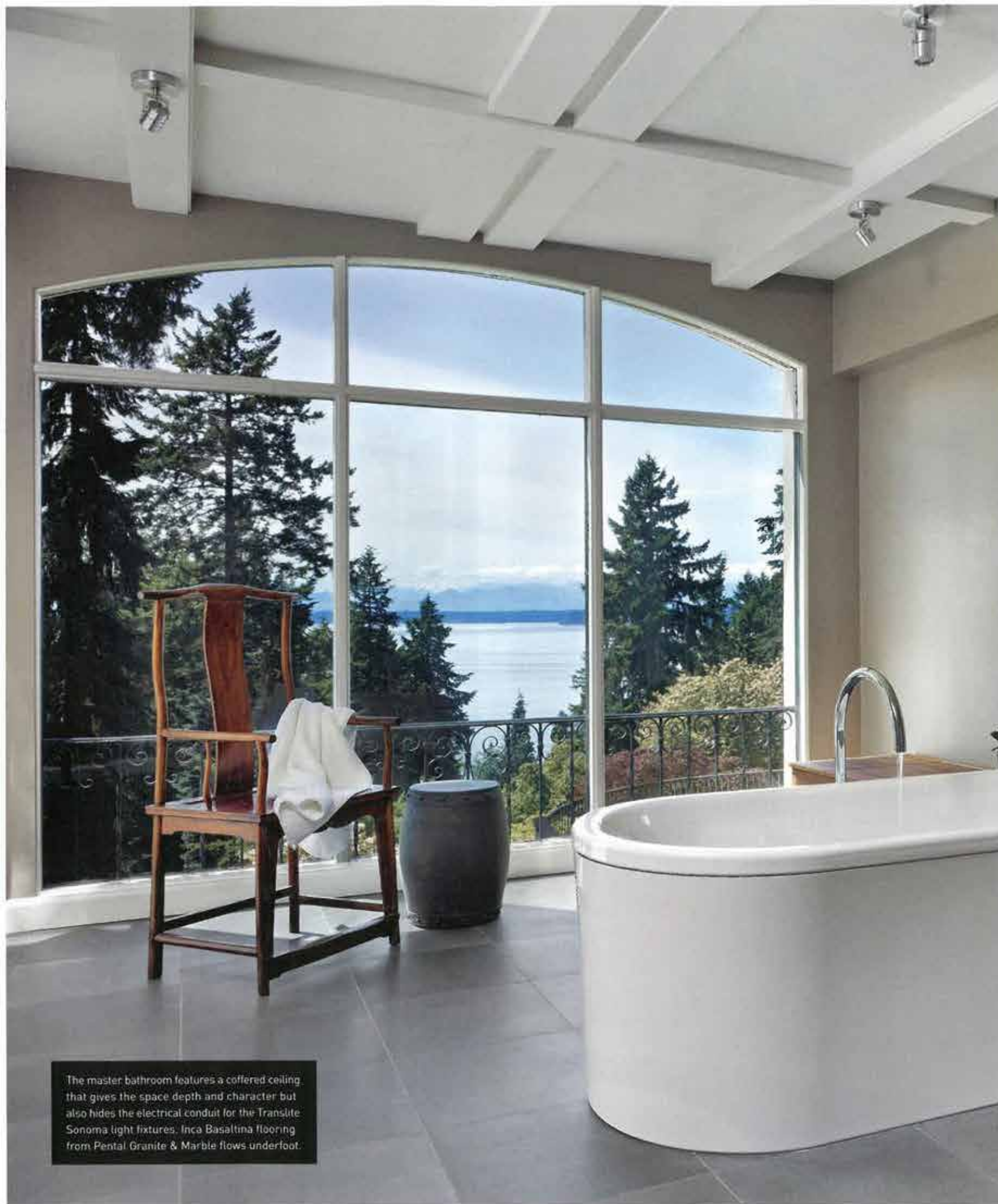
The master bathroom features a coffered ceiling that gives the space depth and character but also hides the electrical conduit for the Translite Sonoma light fixtures. Inca Basaltina flooring from Pentol Granite & Marble flows underfoot.