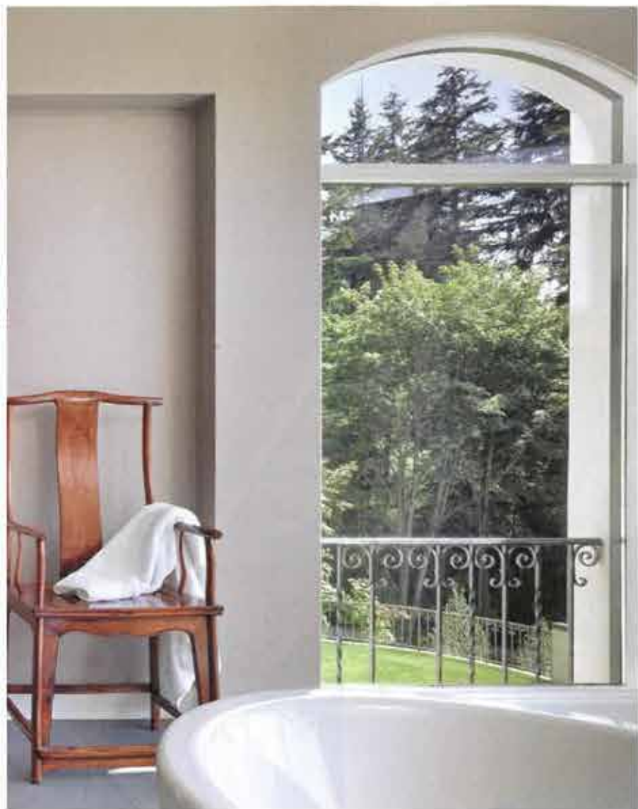
An antique chair from Hong Kong, part of the owners' collection, and a Kaldewei tub from Best Plumbing fill the master bathroom. Loewen windows from Windows, Doors & More flood the spa-like room with natural light.